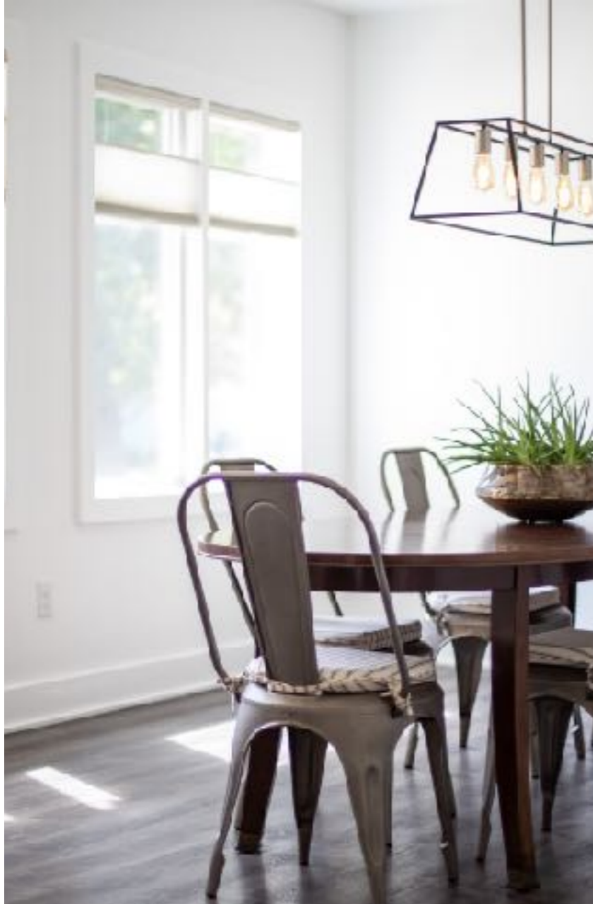
Dining Areas- Less is more! A bouquet or plant will look nice on the table.