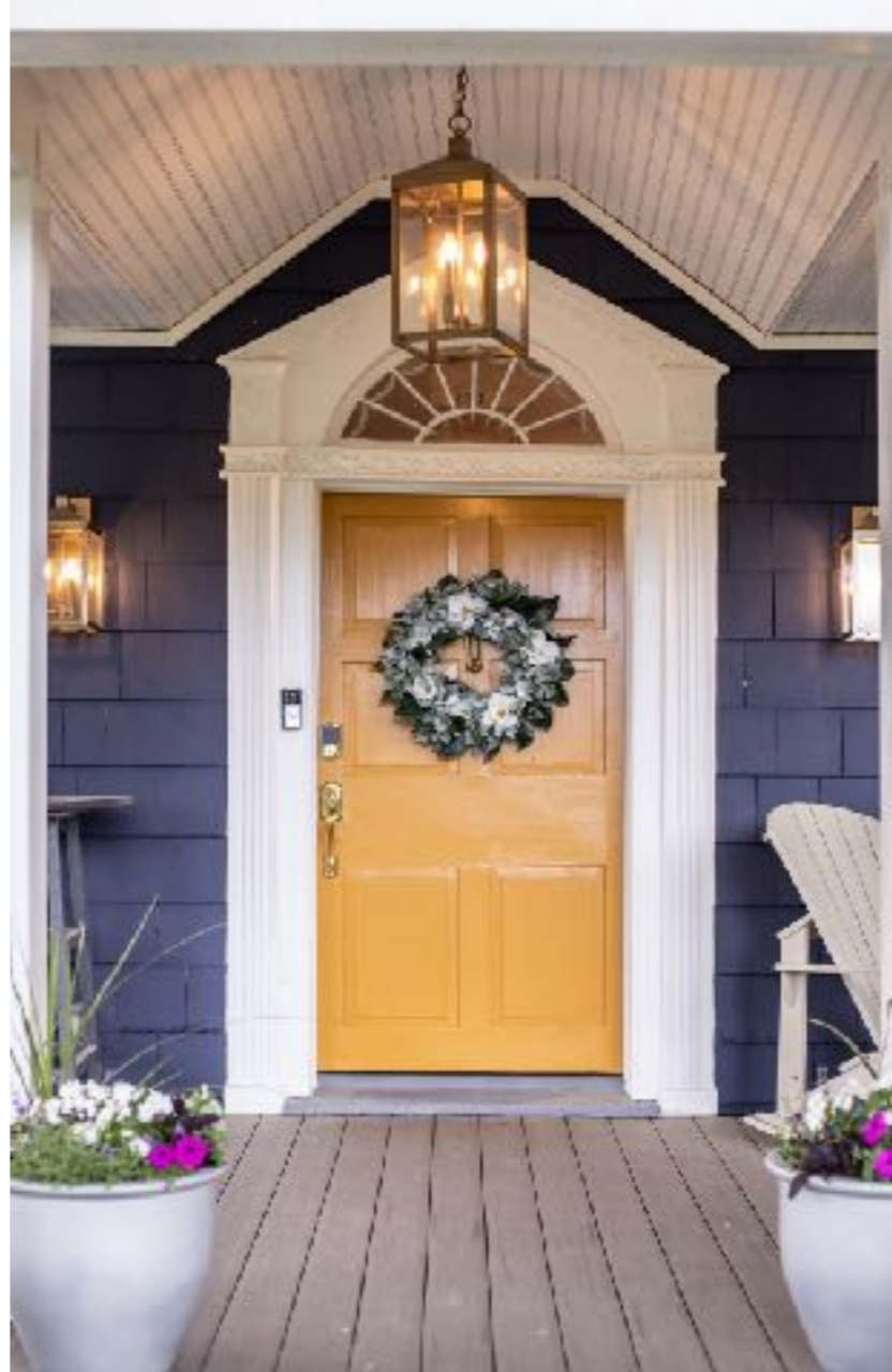
Special features- let us know of any special areas you want to focus on.