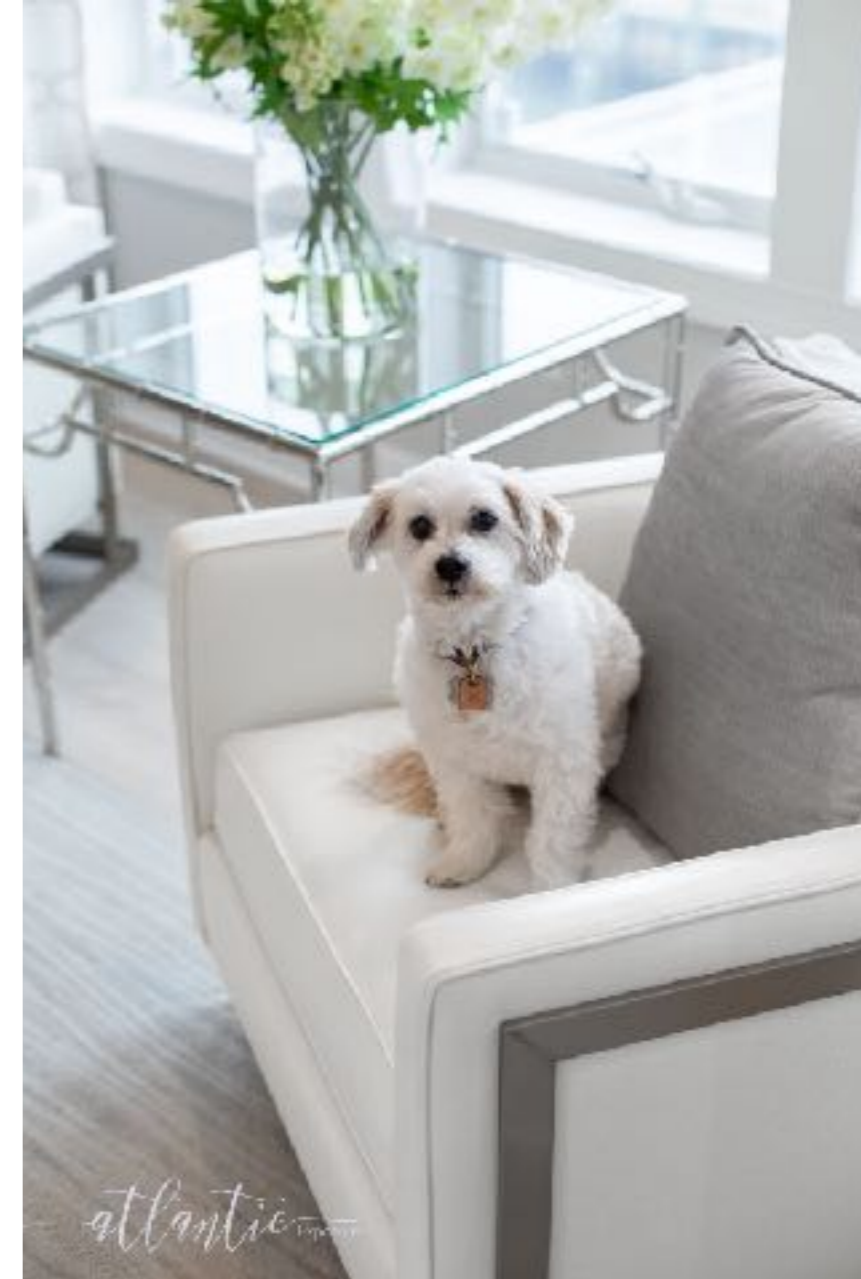
Pets-If your hotel/rental allows pets- show that off! We will be sure to photograph the pet-friendly area!